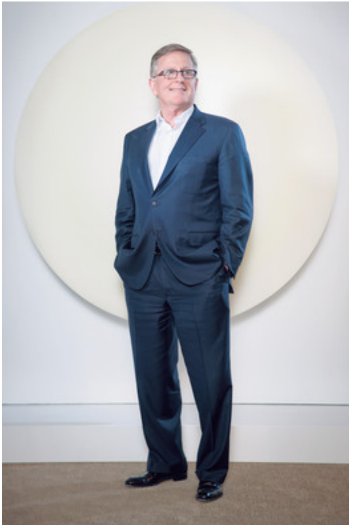
Matthew Mahon for Barron's

The force, in this case, is the theory of efficient markets, first put forth by Fama in 1965. Dimensional's funds all operate on the same principles -- that it's hard to beat the market, and impossible to do it consistently, by stock-picking. There are, however, various factors that can be exploited to provide market-beating returns. That, along with sophisticated trading strategies, a keen eye toward tax-efficiency, and low expenses (the average DFA fund charges just 0.39%) has led to Dimensional's success.